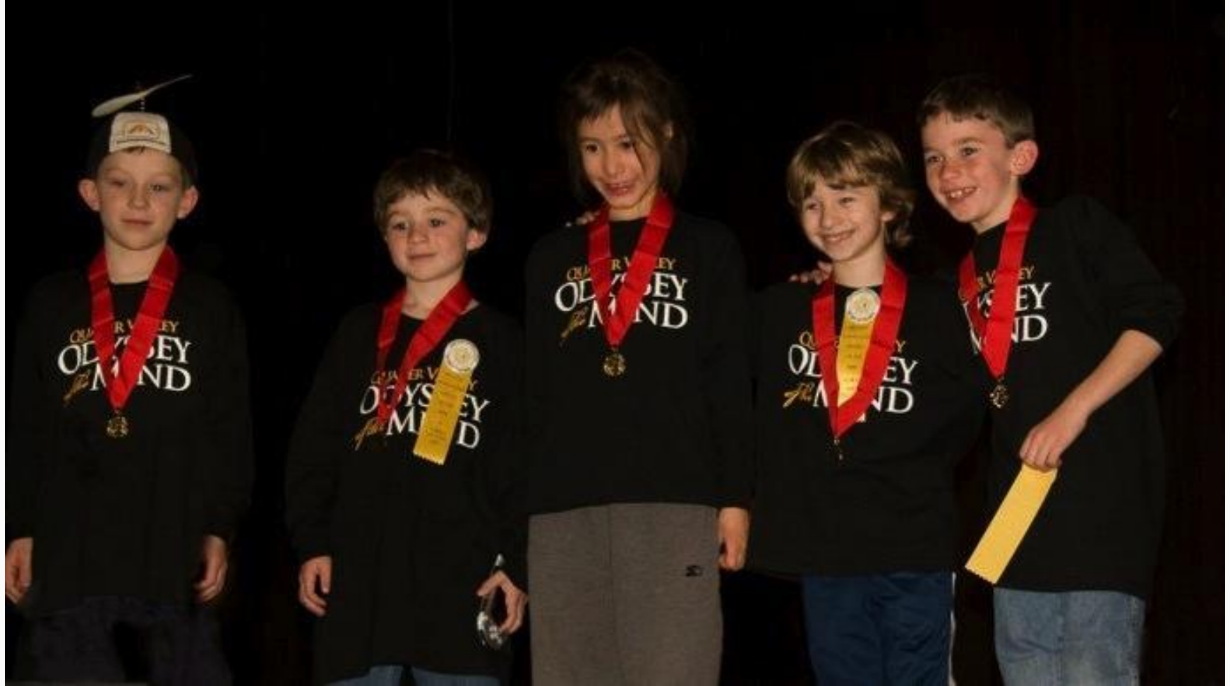
Celebrating "Outside the Box" Thinking